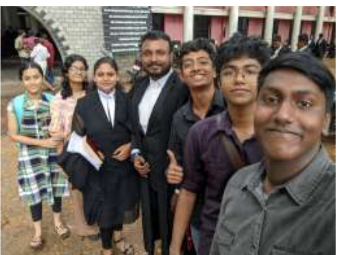
Shyam Sekhar Law Associates