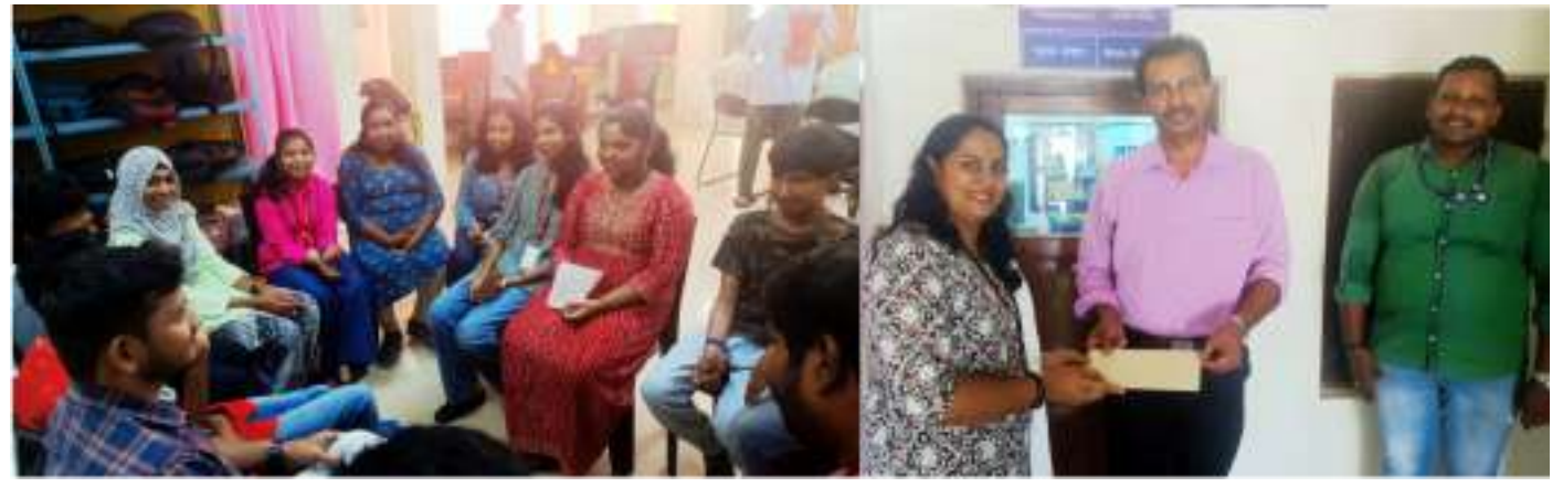
NCSCDA (National Career Service Centre for Differently Abled)