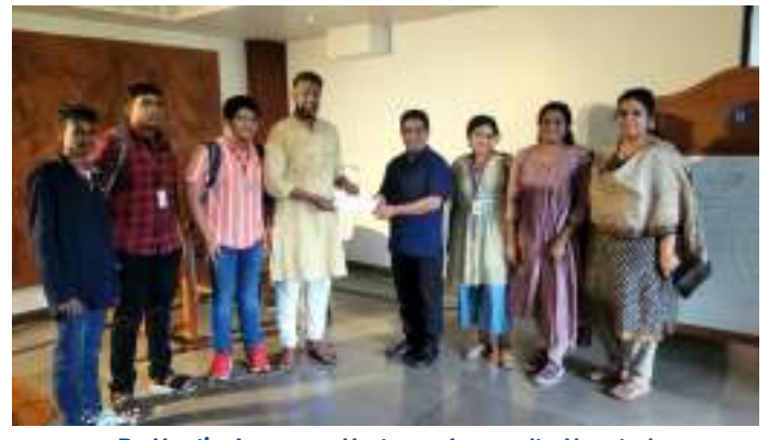
Dr Unni's Agastyaa Heritage Ayurvedic Hospital