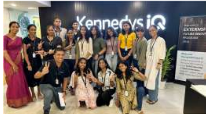
Kennedys iQ Kerala Kaumudi