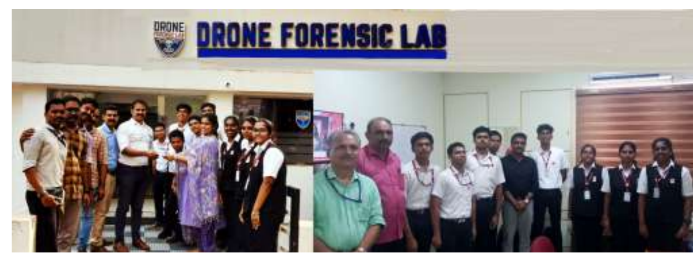
Kerala Police Drone Forensic Lab