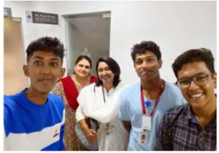
Gitanjali Eye & ENT Hospital