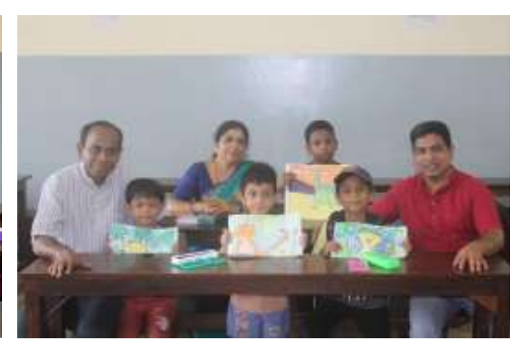
30 Loyola Electronic News Service