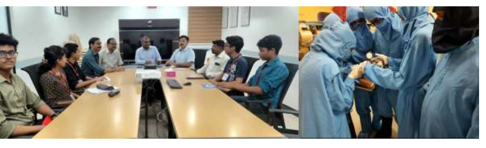
Hindustan Lifecare Limited