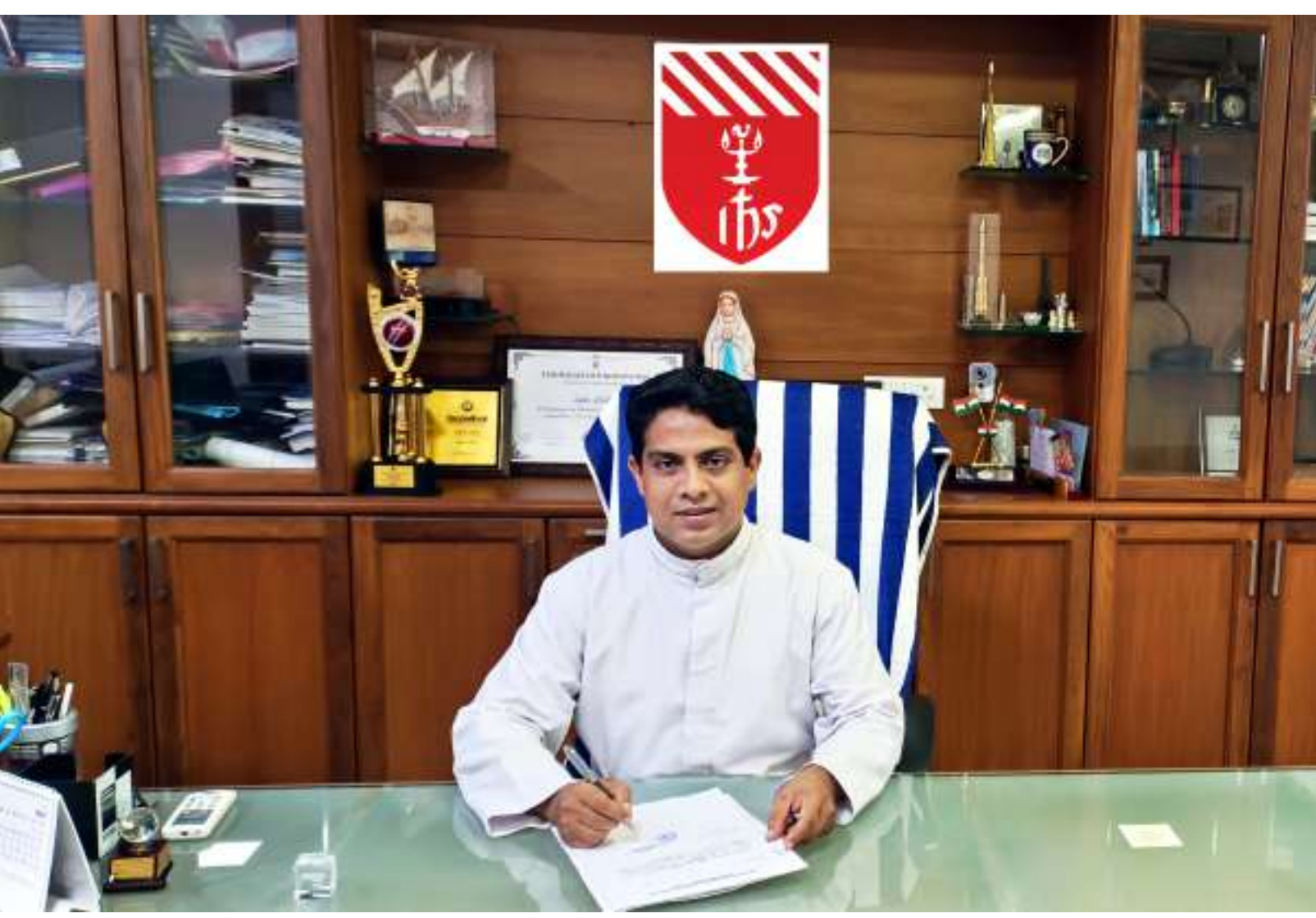
From the Principal's Desk